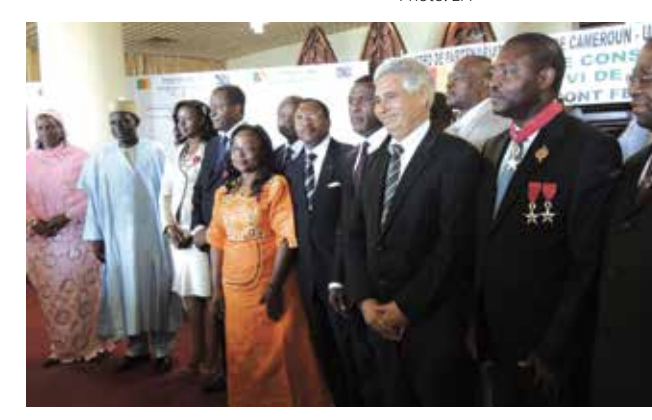
Second Joint Implementation Council of the Cameroon-EU VPA, Yaoundé, July 2012